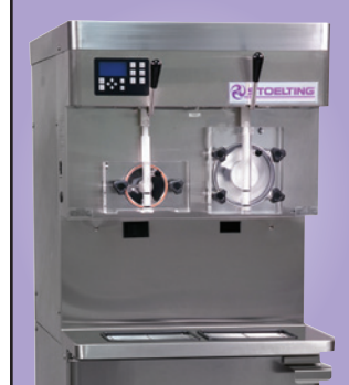
Model U444 (without mixer)