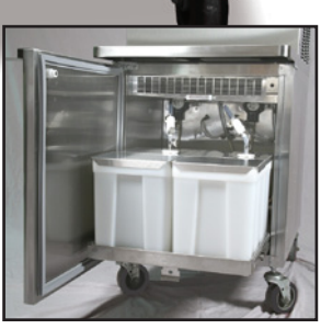
Refrigerated Cab showing slide-out mix shelf & bag connection system